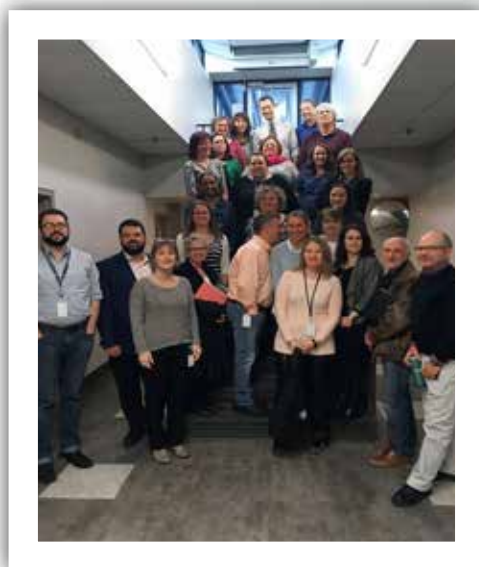
Halifax, Nova Scotia

The survey sample comprised 641 respondents in all. The participation rate thus exceeded the target of 500 respondents set by the ACPI board of directors. Moreover, 83% of the 641 respondents completed the survey in its entirety. To that effect, Bigot et al. (2010: 38) 1 point out that the ideal time for an online survey is 15 to 20 minutes. According to them, the effects of fatigue cause a lower variance in answers at the end of the questionnaire. This phenomenon may have led to a few dropouts at the end of the questionnaire, but the 83% survey completion rate is remarkable.