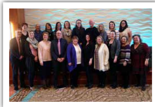
Charlottetown, Prince Edward Island

These findings point to a real opportunity to innovate in the way immersion programs are run to better support immersion professionals in their daily practices and thereby contribute to the continued growth of French immersion programs. In this section, ACPI presents the results of its discussions with immersion professionals during the Canada-wide tour and offers recommendations and solutions that could help achieve these goals. These suggestions could be taken into account when developing federal, provincial, and territorial action plans or be used as part of a national strategy led by an organization identified as a leader in the field by all those consulted—like ACPI.