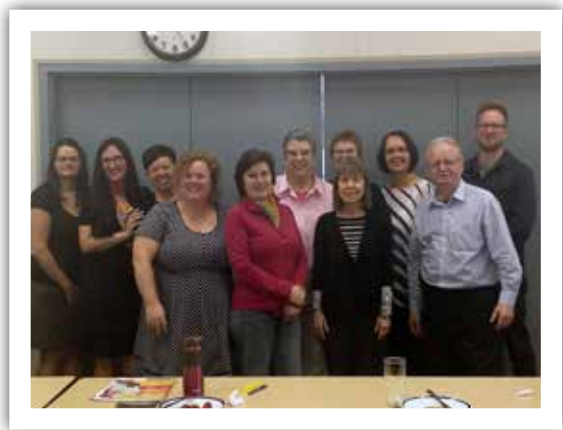
Yellowknife, Northwest Territories

inequity, they suggest that administrators are generally unaware of the specific challenges and realities of French immersion. It appears that there are few or no guidelines to help them manage an immersion program and access quality resources, which leads to considerable inequality and inconsistencies from school to school and school board to school board.