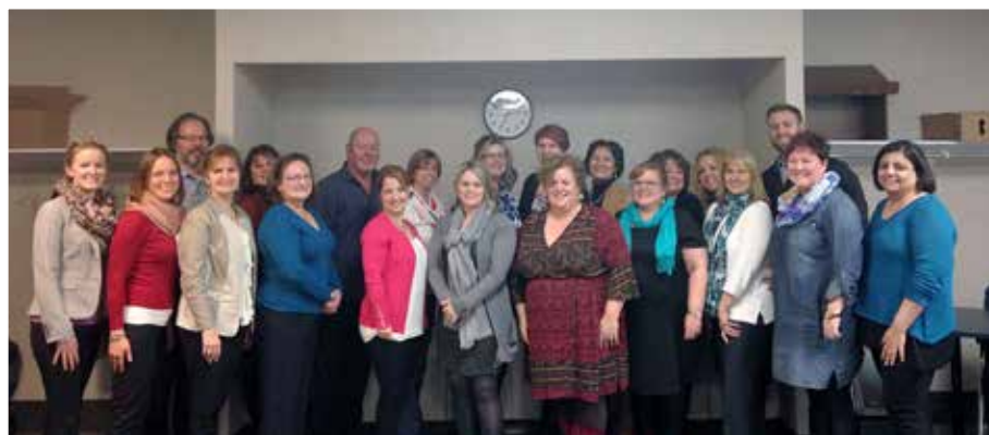
Fredericton, New Brunswick

movies, books, etc.) in French every day. What is more, this ratio changes depending on the province. In Saskatchewan and Manitoba, 33% consume cultural products in French one to five times a week, while in Ontario the frequency is rather one in five times a month. It is also interesting to note that respondents to the English questionnaire are more likely to say that they never choose cultural products in French (11%) or from one to five times a year (24%), whereas more of those who answered the French questionnaire say they choose a cultural product in French every day (45%). Since only a small number (one in three) have access to or make use of cultural products in French, opportunities to hear, read, or speak French are rather rare.