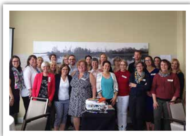
Vancouver, British Columbia